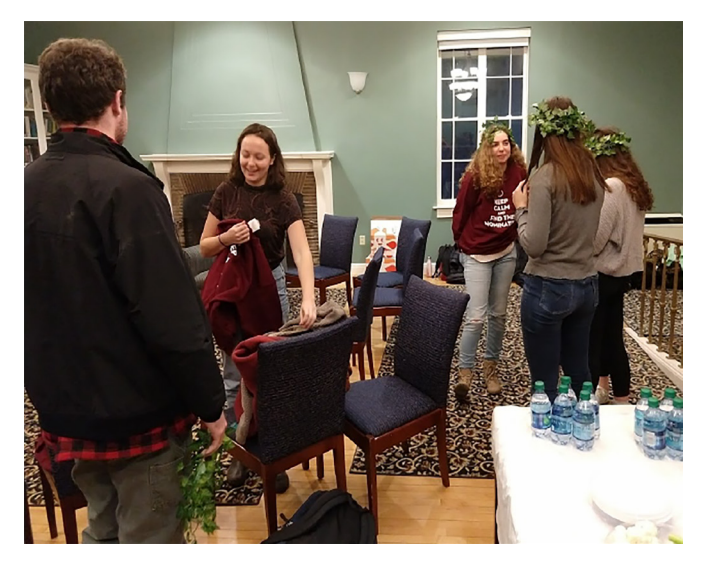
Students and Faculty enjoying ancient Roman cuisine